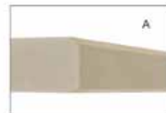
FULL CHAMFERED EDGES