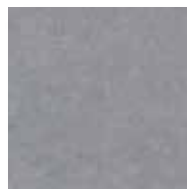
LOUNGE DARK GREY